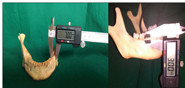
Figure 3: Measurements of buccal and lingual cortical plate thickness and alveolar crestal height with Vernier caliper