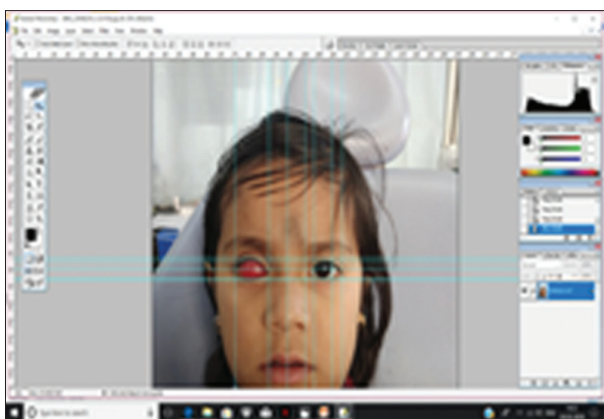
Figure 3: Wax pattern is tried in socket and iris positioning

In literature, black iris disc and painting on iris disc and paper iris disc with digital photography methods are mentioned to customize the Iris 2. However, this process requires considerable