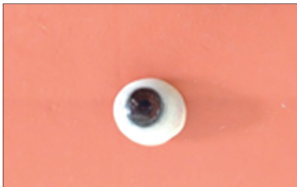
Figure 5: Characterized prosthesis